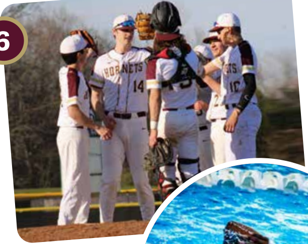
6. The boys baseball team earned five Licking County League player honors.