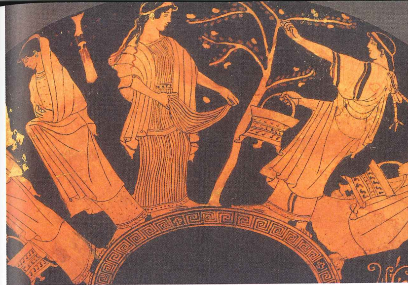
The images on this ancient Greek vase show women gathering fruit.

The Greeks understood the dangers of the sea and treated it with great respect. Sudden storms could drive ships off course or send them smashing into the rocky shoreline. Even in open waters, ships could sink. These hazards encouraged Greek sailors to navigate close to shore, sail only during daylight, and stop at night to anchor.