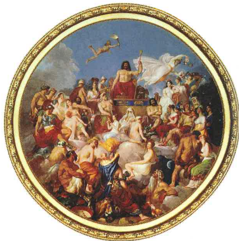
The Greek gods and goddesses of Mount Olympus, shown in this painting, were adapted into Roman religion.