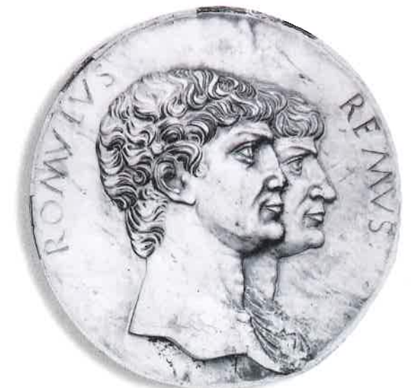
The twins Romulus and Remus, shown on this ancient coin, are the legendary founders of Rome.

The tale of Romulus and Remus is a colorful myth. In this chapter, you will learn about the real founding of Rome. You will also learn how two important groups, the Etruscans and the Greeks, influenced the development of Roman culture.