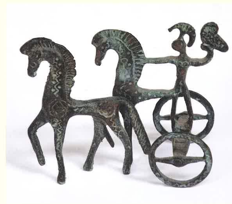
The Etruscans developed the sport of chariot racing, which the Romans later adapted.

The Influence of Greek Art and Religion The Romans greatly admired Greek art. The blend of Greek and Roman styles became known as "Greco-Roman" art. The Romans also made many Greek gods and goddesses their own, although they were more interested in rituals than in stories.