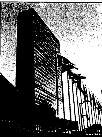
Flags outside the United Nations headquarters. Each flag represents a sovereign state.