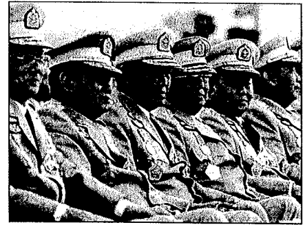
From 1962 to 2011, Myanmar (also known as Burma) was ruled by a military junta that was condemned by the world for its human rights violations.

In an oligarchy (OH-lih-gar-kee), a small group of people has all the power. Oligarchy is a Greek word that means "rule by a few." Sometimes this means that only a certain group has political rights, such as members of one political party, one social class, or one race. For example, in some societies, only noble families who owned land could participate in politics. An oligarchy can also mean that a few people control the country. For example, a junta is a small group of people—usually military officers—who rule a country after taking it over by force. A junta often operates much like a dictatorship, except that several people share power.