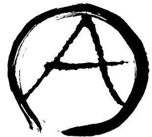
An A inside a circle is the traditional symbol for anarchy.

In an anarchy , nobody is in control—or everyone is, depending on how you look at it. Sometimes the word anarchy is used to refer to an out-of-control mob. When it comes to government, anarchy would be one way to describe the human state of existence before any governments developed. It would be similar to the way animals live in the wild, with everyone looking out for themselves. Today, people who call themselves anarchists usually believe that people should be allowed to freely associate together without being subject to any nation or government. There are no countries that have anarchy as their form of government.