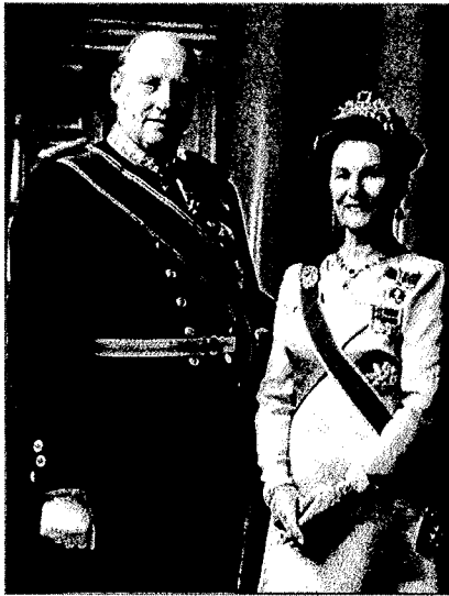
King Harald V of Norway with his wife, Queen Sonja. Norway is a constitutional monarchy. The king is the head of state and has a mainly ceremonial role. The actual government is a democracy.