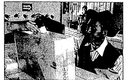
A man votes in Peru.

In a direct democracy , there are no representatives. Citizens are directly involved in the day-to-day work of governing the country. Citizens might be required to participate in lawmaking or act as judges, for example. The best example of this was in the ancient Greek city-state called Athens. Most modern countries are too large for a direct democracy to work.