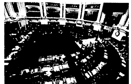
The Peruvian legislature