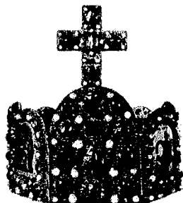
Crown of the Holy Roman Empire, which was tied to the Catholic church and lasted from the 10th—19th century.